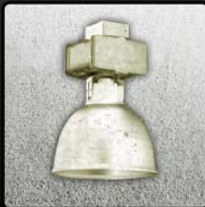
Typical Metal Halide Warehouse Light