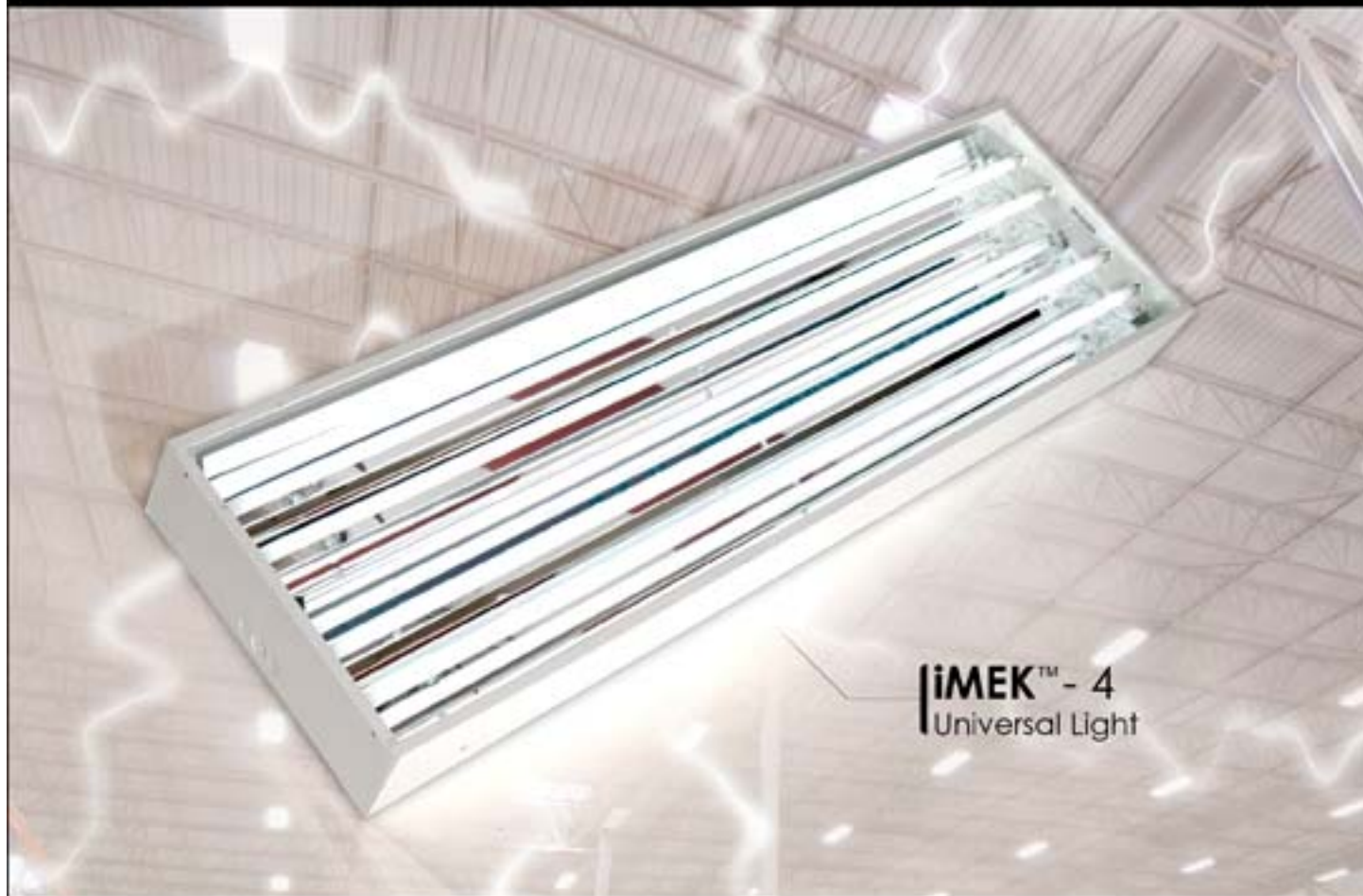
iMEK™ - 4 Universal Light

replace your lights today AND IMPROVE YOUR BOTTOM LINE!