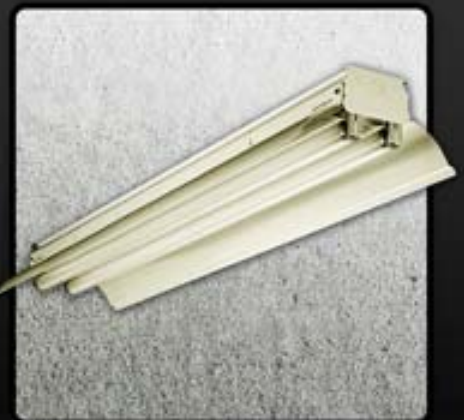
Typical Fluorescent Warehouse Light